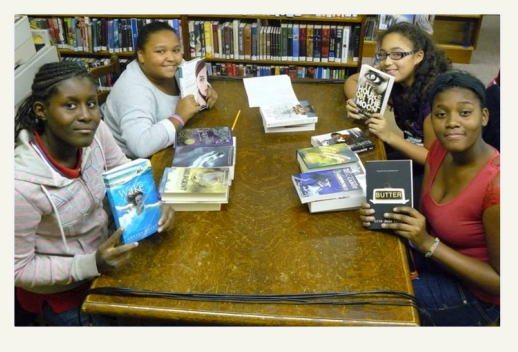
The Teen Advisory Group (TAG) got first look at our new books!

Was Walt Disney? We are happy to announce that the E.B. Crawford Public Library won a giveaway from the Young Adult Library Services Association! The Teen's Top Ten are books that were voted the best of the year by teens around the country. We not only won copies of all ten winners, but all 28 nominees! Come to the library to check out the hottest books of 2013.