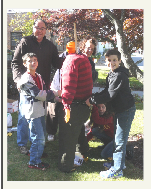
Congratulations to the Cammerino Family on winning Ist prize in the scarecrow decorating contest!

Coming in January: Laptop plugins will be permitted upstairs near the non-fiction collection.