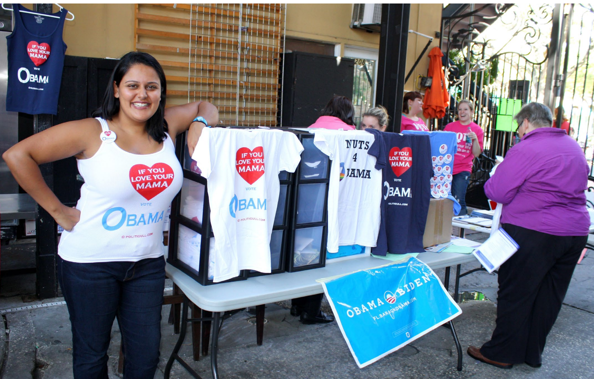
Many at the “I Am Choice” rally were volunteers and interns helping to raise funds for local and national campaigns.