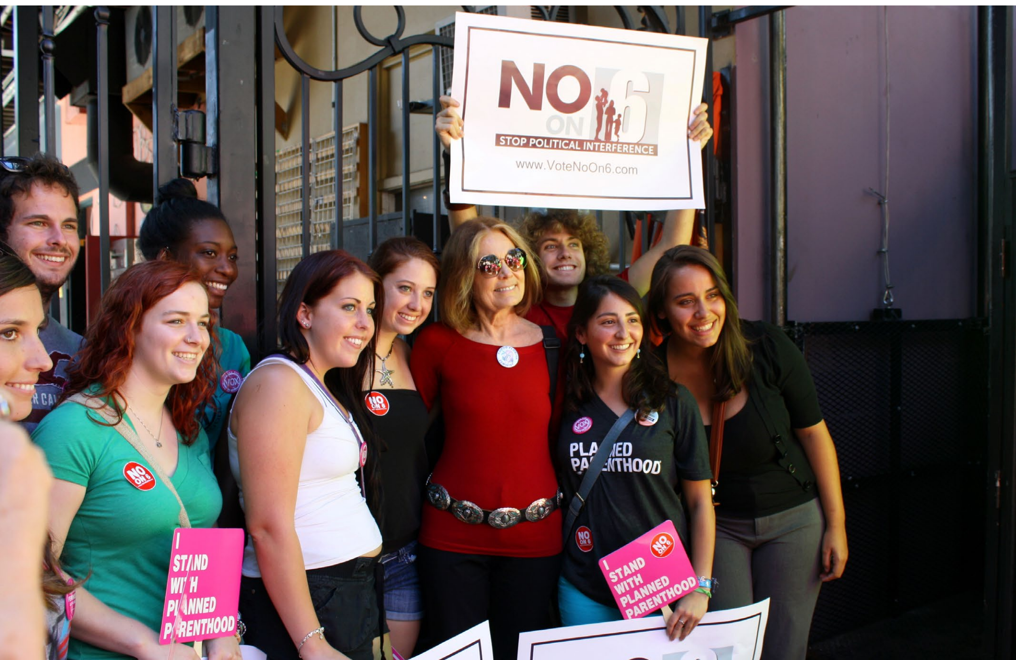
Before meeting with fans following her speech, Gloria Steinem posed for a photo with Planned Parenthood volunteers who helped organize the “I Am Choice” rally.